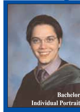
Bachelor Individual Portrait