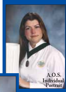
A.O.S. Individual Portrait